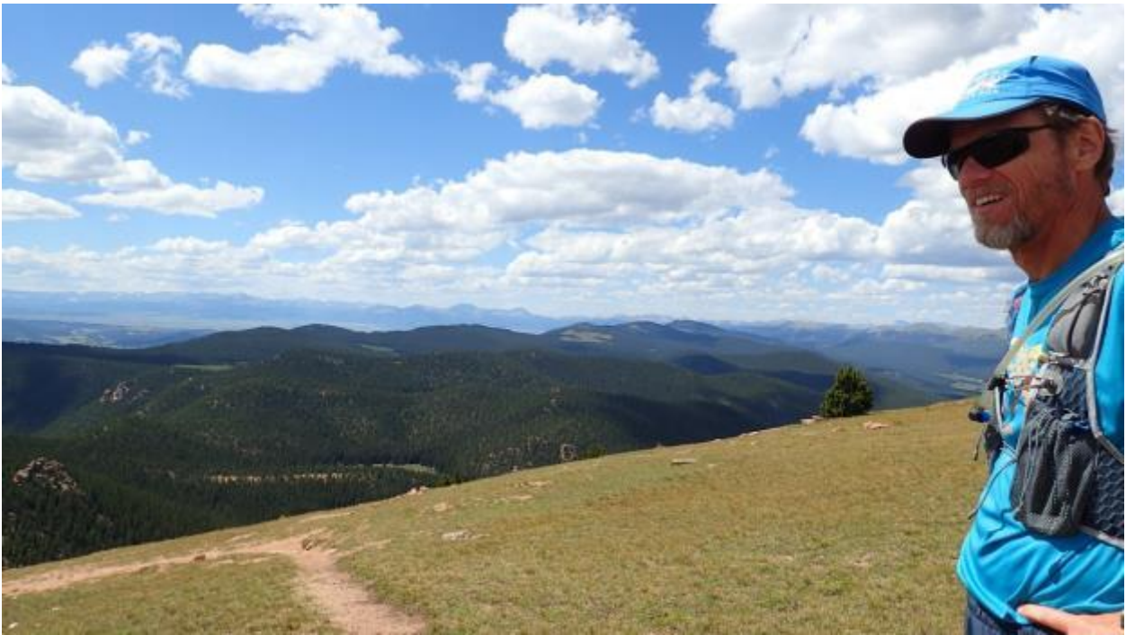
Peter on the Brookside-McCurdy trail below Bison Mountain, Lost Creek Wilderness

The high country has the look and feel of late summer – the first sparse yellow leaves are occurring on plants. I also notice the days getting shorter. There is still a lot of work to be done, lots of trails still to patrol, and we seem to be in a period where a day out is almost guaranteed to have fine weather. Please help us complete our surveys of all trails in both wildernesses. Peter Vrolijk