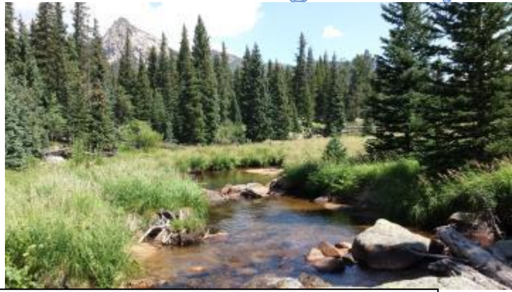
Thistle eradication in Magic Valley near Beaver Meadow Trail