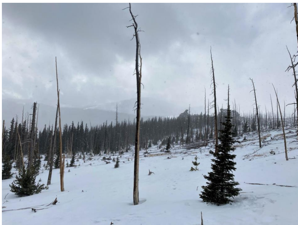
(First Patrol of 2021 – Resthouse Trail)