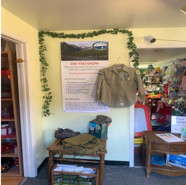
FOMELC Display at the Resale Boutique

If you haven't visited the Resale Boutique in Bailey, then you're missing out on shopping at the cutest, friendliest shop around. Platte Canyon Community Partnership (PCCP) is a non-profit run totally by volunteers. Their purpose is to promote community partnerships through financial contributions primarily through sales at the shop. In the four years they've been welcoming people into their shop, PCCP has given out more than $65,000 in grants.