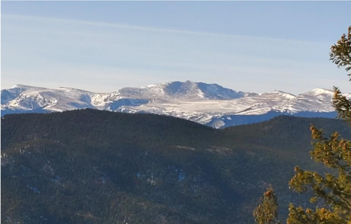
Mount Evans viewed from Bergen Peak, New Year's Day, 2020.

Past the solstice and already daylight lingers a few minutes more in the evening. We wait for the arrival of snow that will allow us to venture into wilderness on snowshoes or spring that will once and for all rid us of the wretched ice covering trails. But the stillness remains, the feeling of being alone in the vast wild areas where nature rules.