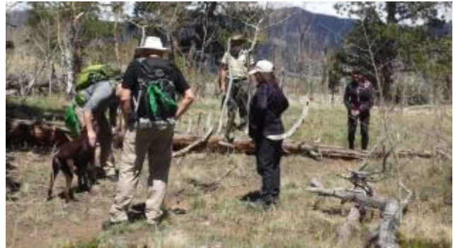
Dog Off Leash Scenario

Camping less than 200 feet from a lake and making a new site rather than an existing site for low impact and minimize campfire impacts scenario (no bonfires)