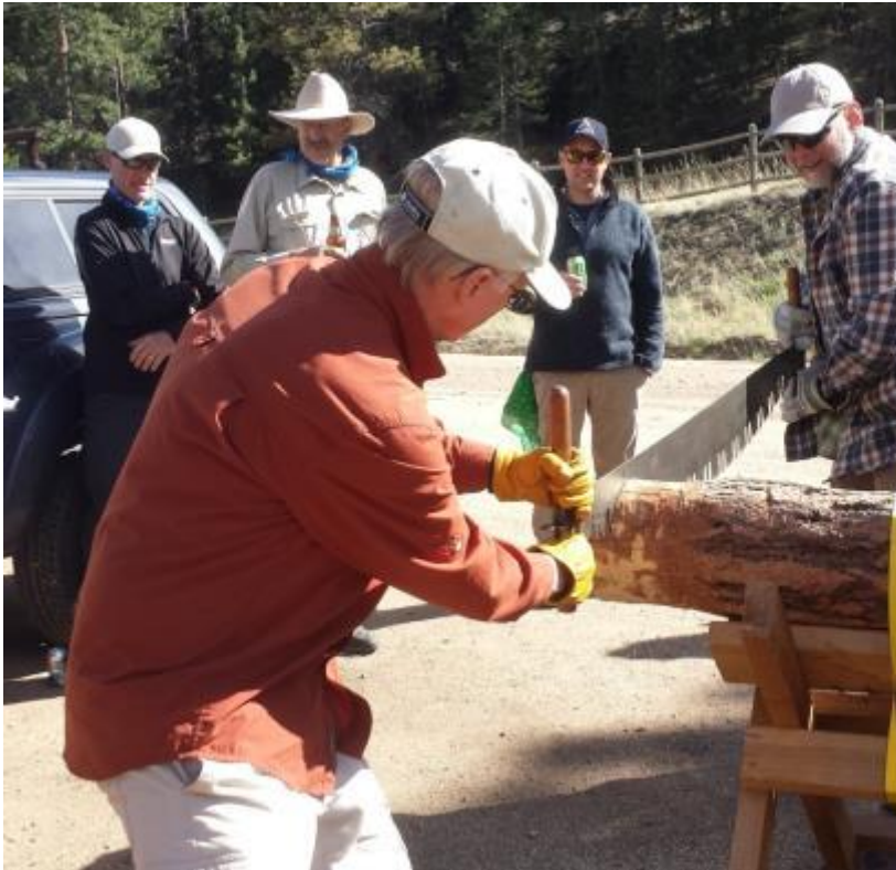
Spring Training May 18-19 Volunteers Slicing "Cookies" for Fun, during the 2 day training program