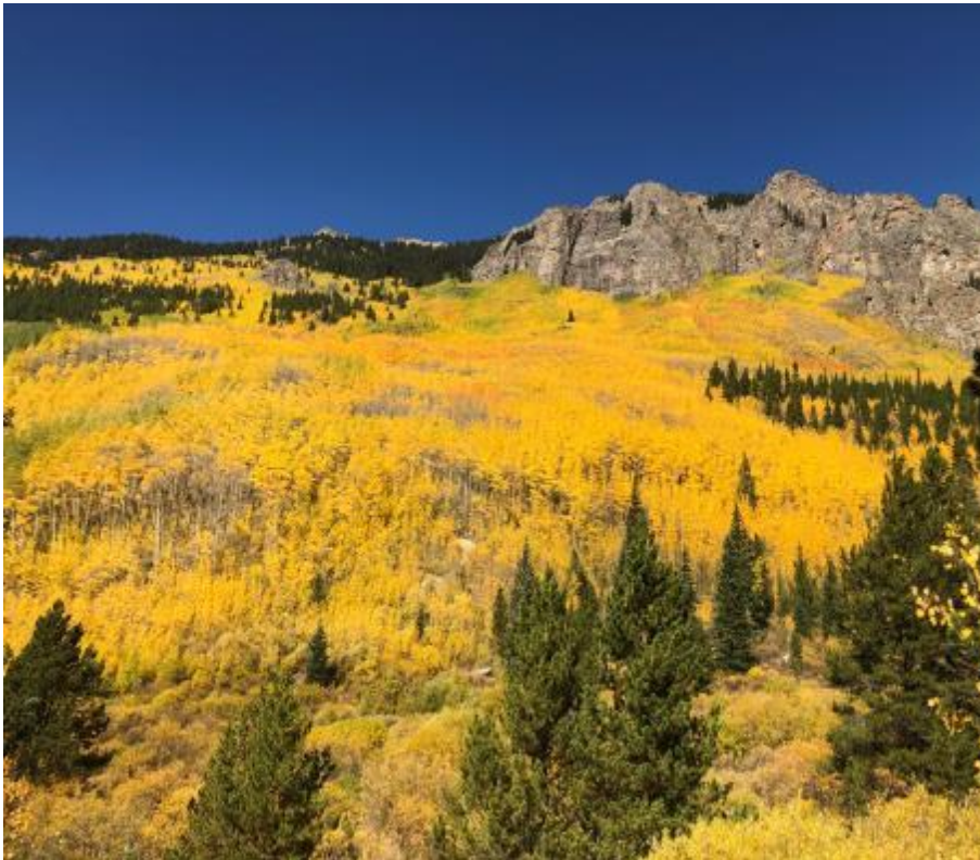
Fall colors in Mt Evans Wilderness – Abyss Lake Trail