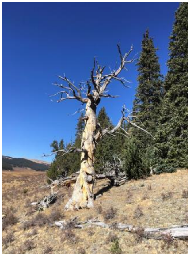
Fall scene in Craig Park, Lost Creek Wilderness

“Nature’s first green is gold, Her hardest hue to hold. Her early leaf’s a flower; But only so an hour. Then leaf subsides to leaf. So Eden sank to grief, So dawn goes down to day. Nothing gold can stay.” – Robert Frost